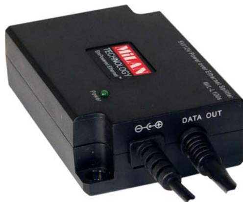
Figure 2-2. Data Out and Power Out ports