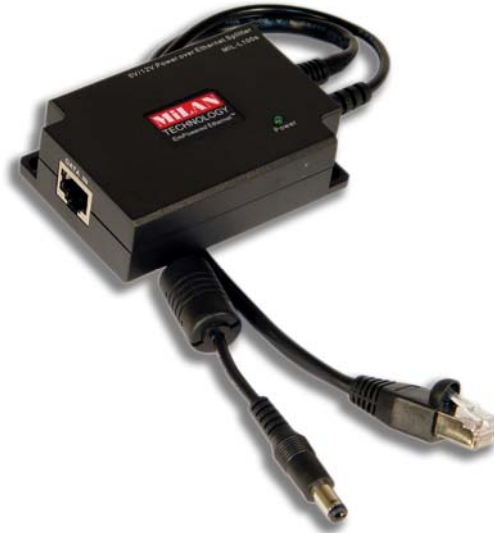
Figure 2-3. System Power LED Indicator