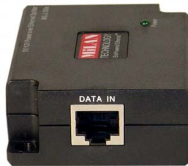
Figure 2-1. Data In port